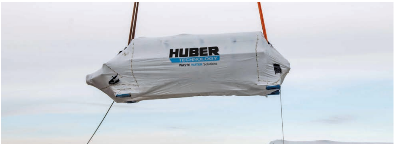
A disc dryer is lifted into place with the help of a heavy-duty crane.

The control of the disc dryer is dependent on the detected DR content at the inlet and outlet. This provides the possibility to react to fluctuating DR contents of the dewatered sludge