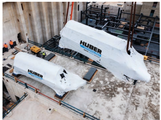
Disc dryers being placed in the building.