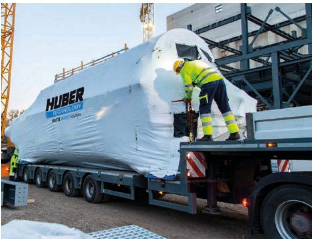
Preparations for lifting a disc dryer.